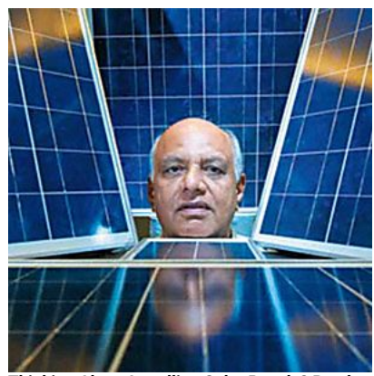
Thinking About Installing Solar Panels? Read This First