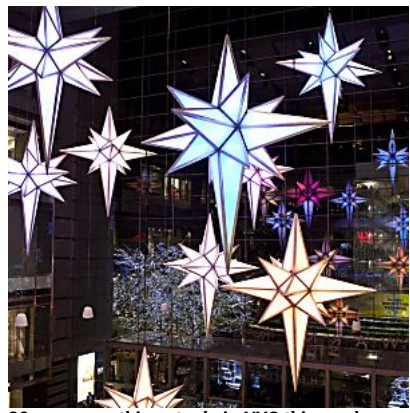
20 awesome things to do in NYC this week (https://www.timeout.com/newyork/blog/20- (https://www.timeout.com/newyork/blog/the-this winter awesome-things-to-do-in-nyc-this-week-122816)