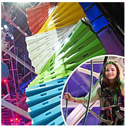
Warm Up to Winter with These Indoor

(https://www.energybillcruncher.com/pa/?